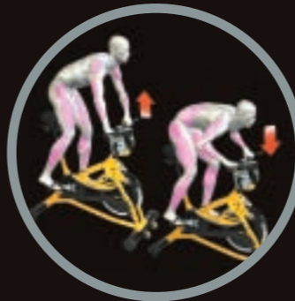
Squat / Jump

Everyone will benefit from VR X-Biking regardless of fitness levels or experience. And no matter what, you are always in complete control of how hard or easy you want the ride to be. Your X-Bike even instinctively 'coasts' allowing you to stop pedalling anytime you want.