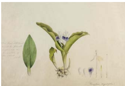
From Monandrian plants..., by William Roscoe

There are also many other fine illustrated natural history and travel books in the library.