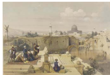
From Travels to the Holy Land..., by David Roberts