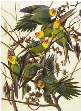
Carolina Parakeets, from the Birds of America

Star of the collections is undoubtedly the astounding four volume Birds of America , by John James Audubon, rightly described as the world's greatest natural history book, which comprises 435 life size full colour engravings. One volume of this magnificent work is on permanent display in the Picton Library; a page is turned every week to enable regular visitors to see a different picture each time they come.