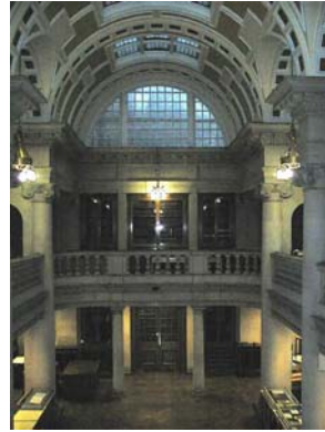
The Hornby Library