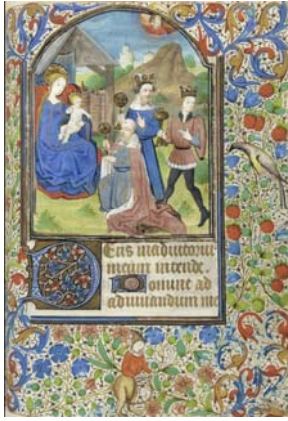
Book of hours

Also among the Central Library's treasures are beautiful medieval manuscripts, rare early printed books, exquisite fine bindings, charming children's picture books, superb craft printing, and much more.