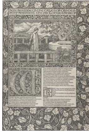
Chaucer's Works, Kelmscott Press