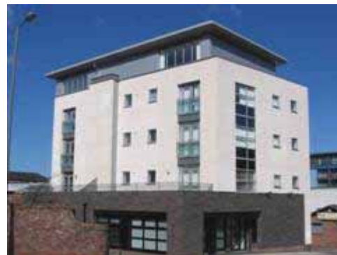
New apartment building completed at Bridport Street/Ward Street/Vincent Street in January 2006