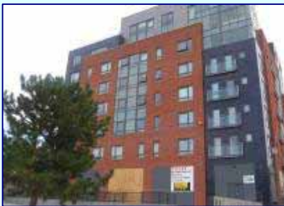
The popular "City Gate" development completed at Oldham Street in July 2006 has transformed this previous derelict area. Another similar development for an adjacent empty site is proposed.

**NOTE: Data used does not cover entirety of the calendar years 2000 and 2006. Figures for 2006 only as far as September. Figures for the whole of 2006 will not be available until summer 2007.