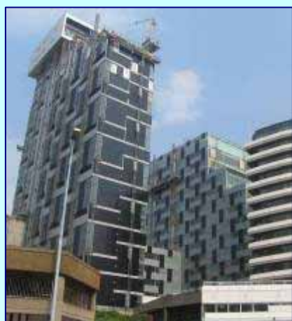
The Unity development as it was nearing completion in December 2006

2006 saw another year of feverish activity by developers bringing yet more new apartments to the City Centre market. This trend is set to continue into 2007 with around 1800 units due to be completed in the next 12 months. However, the recent figures up to September 2006 suggest that prices are no longer rising at the same levels as they have been for the last five years