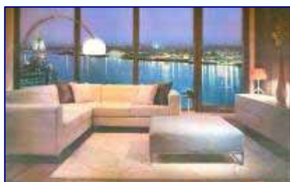
Show apartment in Rumford Investments' Unity development – being used in current marketing

At the other end of the scale, a glance in the windows of City Centre estate agents and through local property magazines such as 'Your Move' still show some city centre apartments being available for around £100,000, which means that Liverpool still offers a selection of affordable homes in its city centre compared to many other cities.